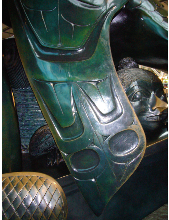
The Spirit of Haida Gwaii, The Jade Canoe by Bill Reid